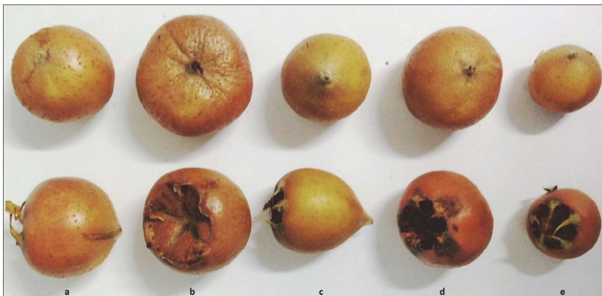
FIGURE 1. Ripe fruits of the four medlar cultivars in comparison with a wild type fruit (a = 'Precoce'; b = 'Gigante'; c = 'Goccia'; d = 'Comune'; e = wild type).

The dynamics of the phenological phases were followed in the field by periodically detecting the main stages as described by Bellini et al. (2007). The considered stages were swelling of the buds, open bud, appearance of the green flower bud, open flower-full bloom, fruit set, and fruit at harvest maturation.